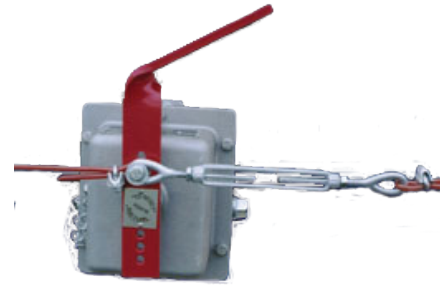
*RSB with Cable Break Detection