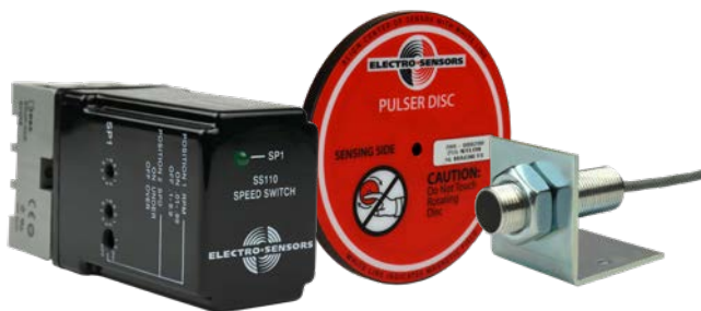
Standard System with: SS110 Speed Switch, 906 Speed Sensor, 255 Pulser Disc

An example of a standard SS110 system includes the SS110 DIN rail mount module, a 906 Hall Effect Shaft Speed Sensor, and a 255 Pulser Disc. Other shaft speed sensor and pulser target options are available.