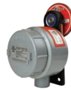
EZ-SCP Mounting Option