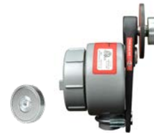
MM-2.00 Mounting Magnet Option (must be used with EZ-SCP)